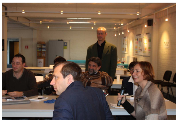
Working group at Tobacco Control Advocacy and Campaign Workshop

http://www.europeancancerleagues.org/internet/en/page.asp?niv=2&SM=480&SM2=358&Sid=GP&lv=2